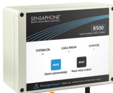
FGD-L8500 Sensaphone 8500 Zone Type Liquid Leakage Alarm System