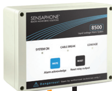
FGD-L8500 Sensaphone 8500 Zone Type Liquid Leakage Alarm System